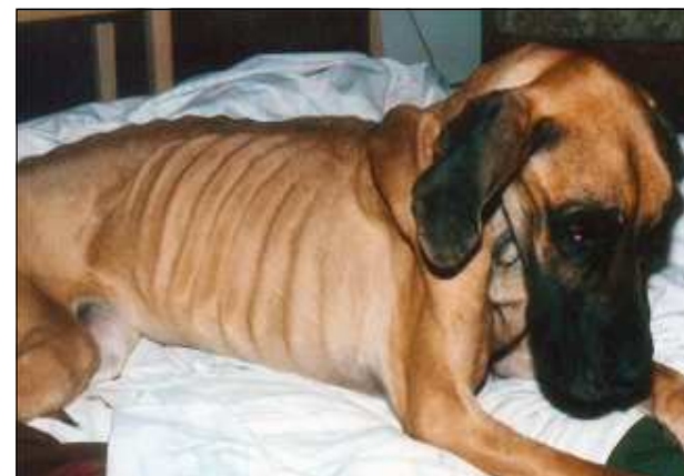
Starving dog rescued by the Ontario SPCA

Remember, you can send a letter to your MP's Parliament Hill office postage free!