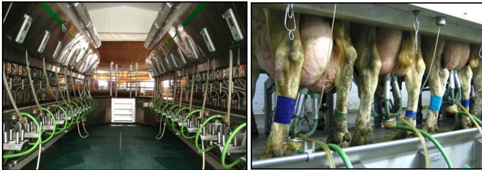
Modern milking parlour: (Left) This parlour can milk 20 cows at a time. (Right) Milking in action: cows have the milking machine attached to their teats.