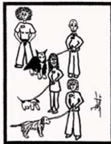
DOG OBEDIENCE TRAINING