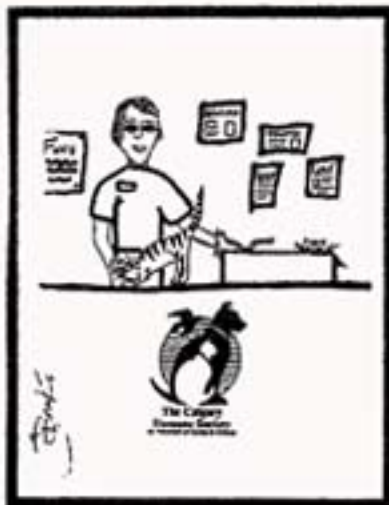
LOST & FOUND