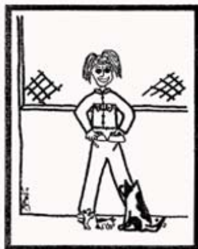
ANIMAL CARE ATTENDANT